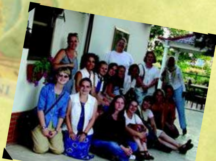
(left) Converse College students gather on the porch of a trattoria in Satta Lucia. (below) One of many magnificent churches visited by Converse students.

For me, the most exciting part of the trip was the opportunity to visit the convent of Sta. Francesca Romana, the 15th century saint who was the subject of my site project. She lived in Rome during the Great Schism, a time of widespread famine and plague (which killed one of her children). Amidst this chaos she founded a non-cloistered religious community, the Oblates of the Tor dé Specchi. Earlier in the year I wrote and asked permission to meet the Oblates since the convent is not open to the public, and they responded to my letter by inviting me into their home. Two wonderfully friendly English monks guided me through the fascinating place, which did not seem to have changed much at all since Sta. Francesca lived there as a lay sister. It was indescribably thrilling for me to have had the opportunity to explore the art, space, and life of a saint I had been researching for a year with people who are experts on the subject. We saw the frescos of Sta. Francesca's life, which I had used as visuals