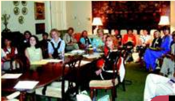
(above) Team Converse participants break into groups to attend informational sessions as part of their training.

establishing an internship for a current student; making a special gift to support a program or scholarship of interest; hosting, planning, or attending an alumnae event; or serving as a club chair or class representative. It also entails encouraging other alumnae and friends to become more actively involved. Team Converse fills a critical need for the College: it establishes a network of trained volunteers throughout the nation to help expand Converse's reach to a national level.