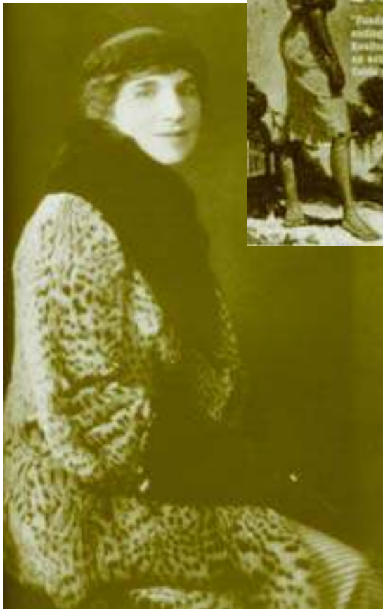
(below and right) Julia Mood Peterkin received the Pulitzer Prize for her 1929 novel, Scarlet Sister Mary . To this day, she is the only South Carolinian to receive the award.

History has a way of righting the wrongs of yesteryear. In 1994, Julia Peterkin was inducted into the South Carolina Hall of Fame, and Converse College established the Julia Peterkin Award in an effort to introduce students to strong writers from across the country. To this day, the award has brought talented visiting writers to the College campus to influence and inspire Converse students.